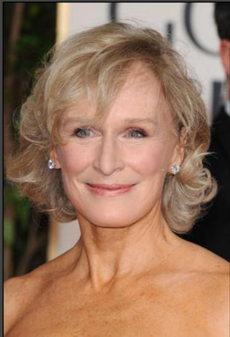
GLENN CLOSE Fatal Attraction Dangerous Liaisons

Dramatic, emotional star of stage and screen. She returns home to reunite with the daughter she hasn't talked to in twenty years.