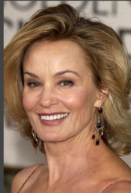
JESSICA LANGE Frances The Great Lillian Hall