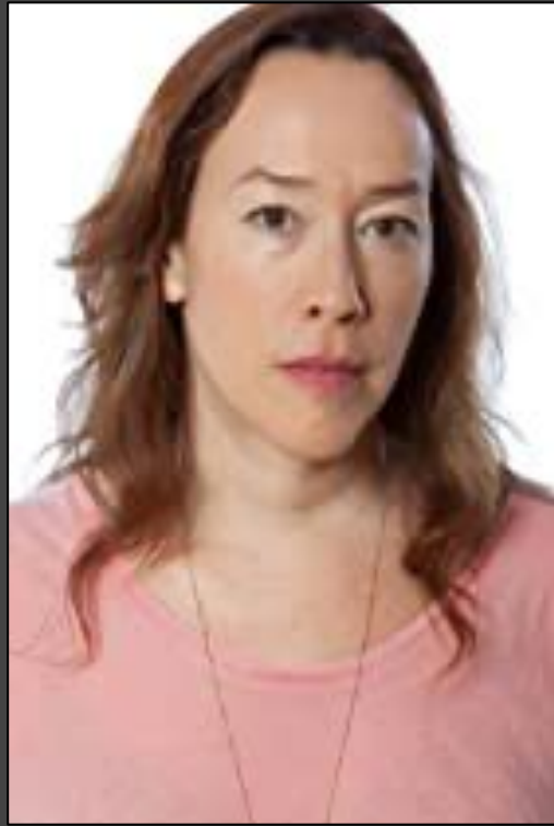
KARYN KUSAMA The Invitation Girlfight