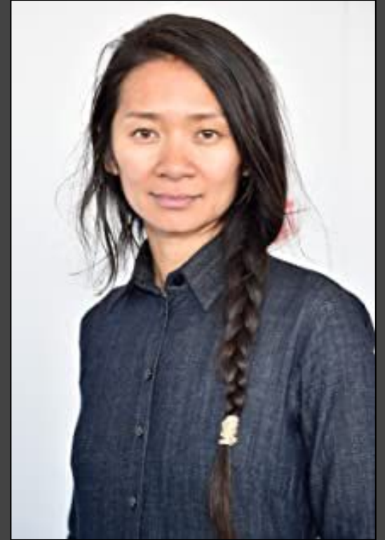
CHLOE ZHAO Nomadland The Rider