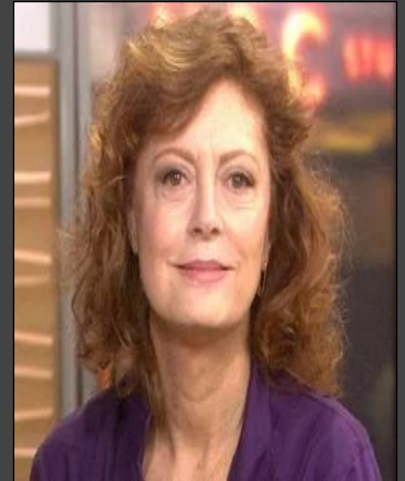
SUSAN SARANDON Thelma and Louise Little Women