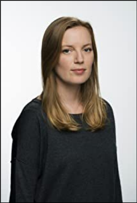
SARAH POLLEY Away from Her Women Talking