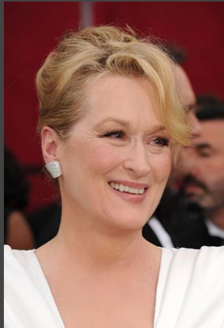
MERYL STREEP Sophie's Choice Devil Wears Prada